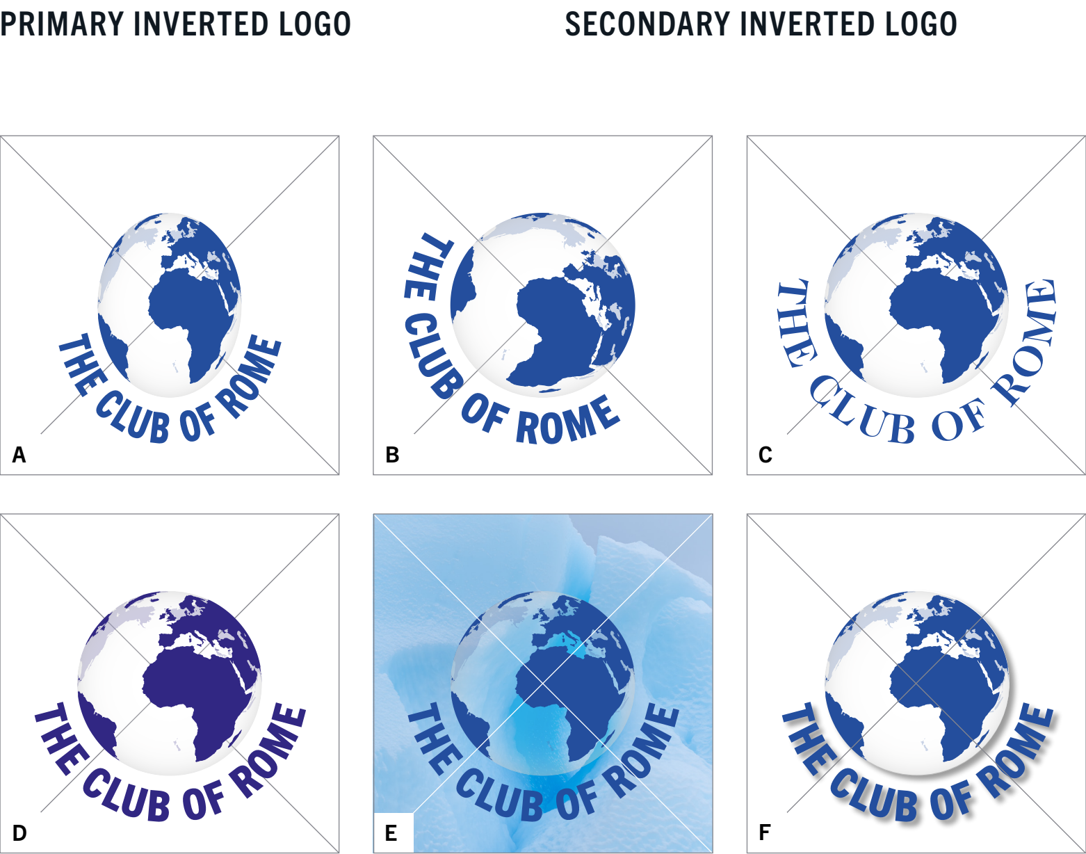
WHAT NOT TO DO